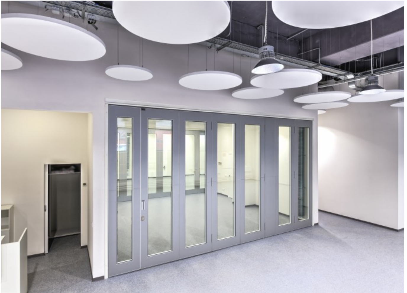
Glass walls in the pharmaceutical factory building.