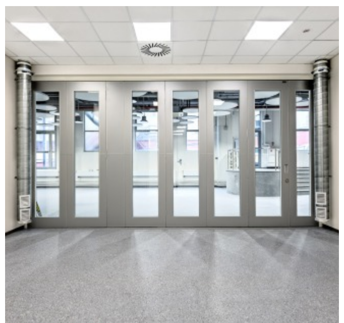
Glass walls in the factory