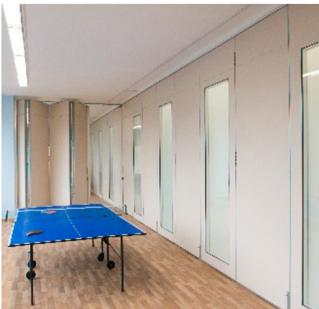
Glass walls in the building of a specialized lyceum